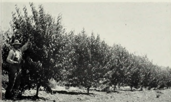
"C & O" Peach Trees 15 Months After Planting

Whitney —Large, glossy, striped with carmine. Juicy—pleasant flavor. An excellent ornamental tree, beautiful bloom.